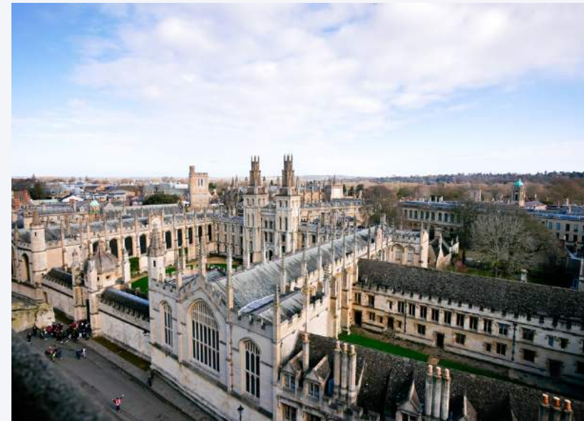
DISTRICT / BOROUGH